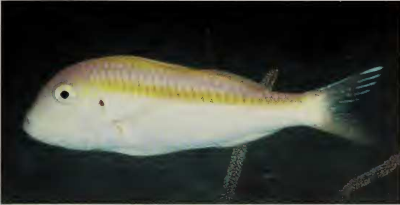
Fig. 3. Parupeneus fraserorum , KwaZulu-Natal.